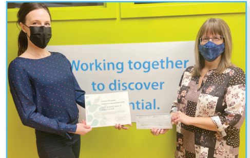
Red Deer & District Community Foundation