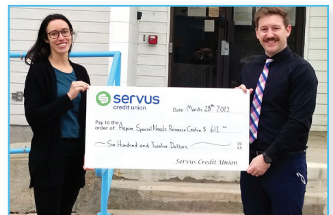
Servus Credit Union