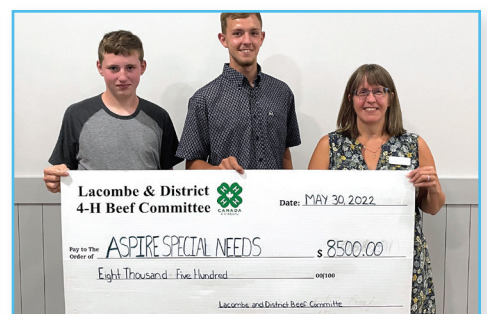
Lacombe & District 4-H Club