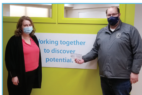
Piper Creek Optimists