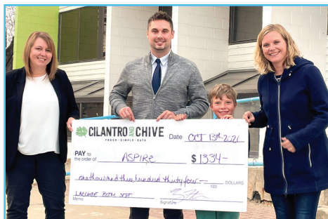
Cilantro & Chive