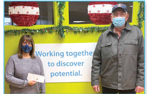
The Coverall Shop

For any oversights, please accept our apologies and contact Melissa Vine at mvine@aspireneeds.ca