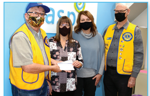
Sylvan Lake & District Lions Club